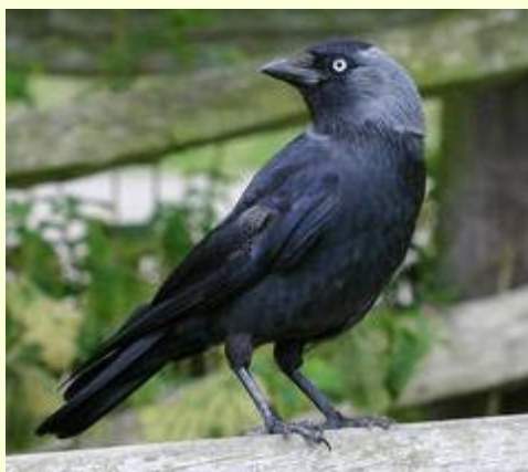
Jackdaw – Coloeus monedula

ID: Small crow with grey neck and pale eyes. Loud and sharp 'tchack' call (from which it is named).