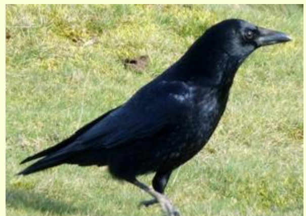
Crow – Corvus corone

ID: All black plumage with shiny black beak. Deep 'caw' call. Often in mixed flocks with Jackdaws and Rooks.