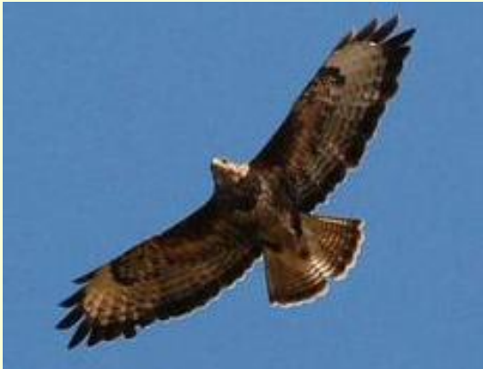
Buzzard – Buteo buteo

When viewing online, simply click on the species name to find out more.