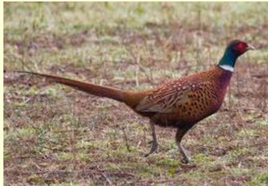
Pheasant – Phasianus colchicus

ID: Male is red-brown with a green neck and red face patches. Females are all pale brown. Long tail.