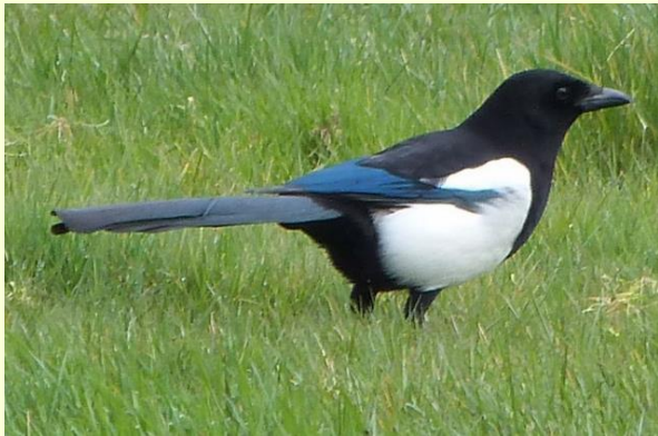
Magpie – Pica pica

ID: Black and white with long tail. 'Black' reflects as blue-purple in good light.