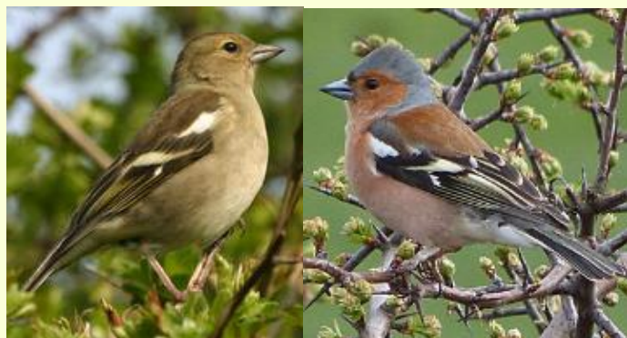
Chaffinch – Fringilla coelebs

Similar: None (other colour forms occasional).