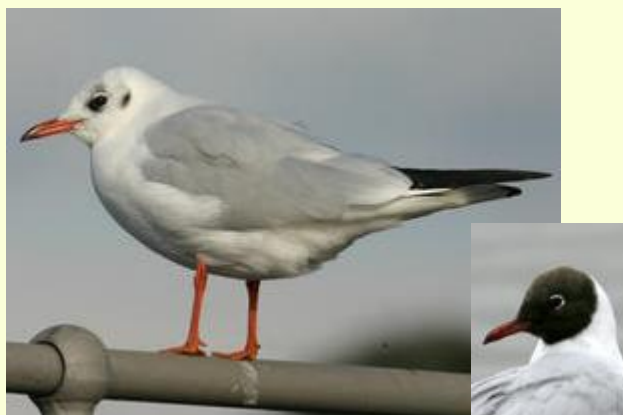
Black-headed Gull – Chroicocephalus ridibundus

Similar: House Martin (white rump, no tail streamers)