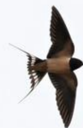
Swallow – Hirundo rustica

ID: Blue head, red throat, pale belly, tail streamers.