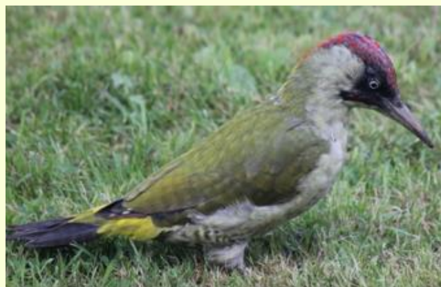
Green Woodpecker – Picus viridis

ID: Largest woodpecker. Green back, yellow rump (seen in flight), red head. Loud 'yaffle' call.